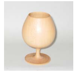
Ken Staggs Maple