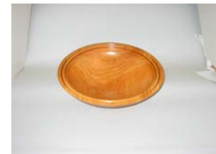
Francisco Bauer Cherry Bowl