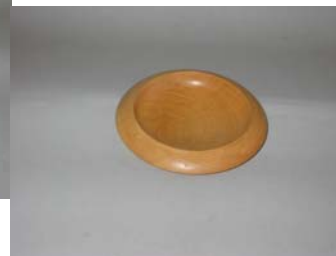
Bill Brown Maple Bowl