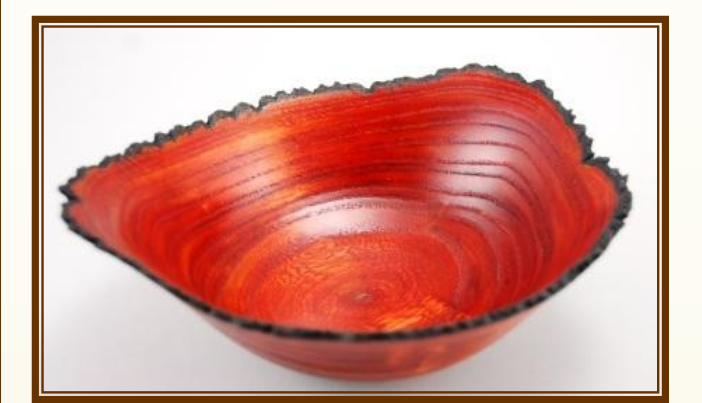
Al Miotke Elm