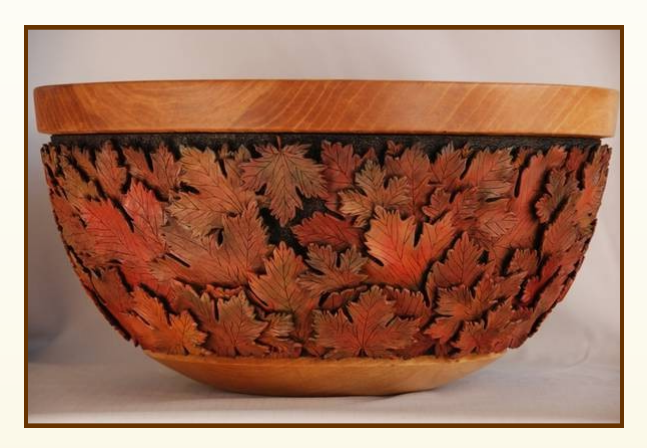
Week of Jan 3 Sycamore