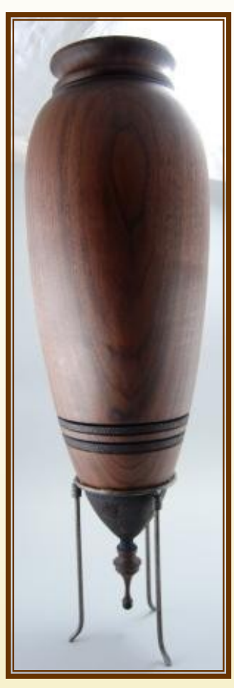
Kelly Bissell Walnut