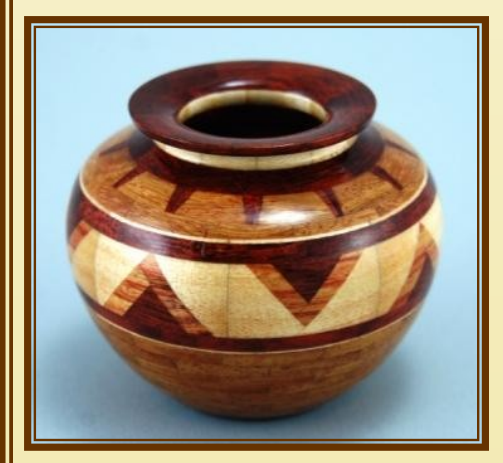
Al Miotke Pau Rosa, Maple, Bloodwood, Wenge, Tulipwood