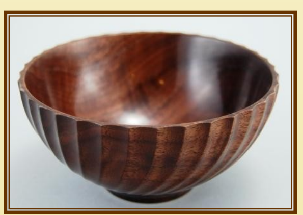
Roy Lindley Walnut