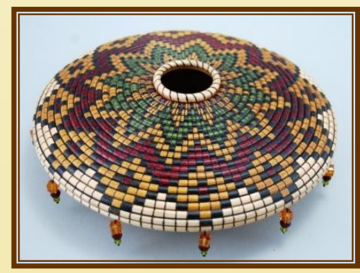
Fred Gscheidle Maple