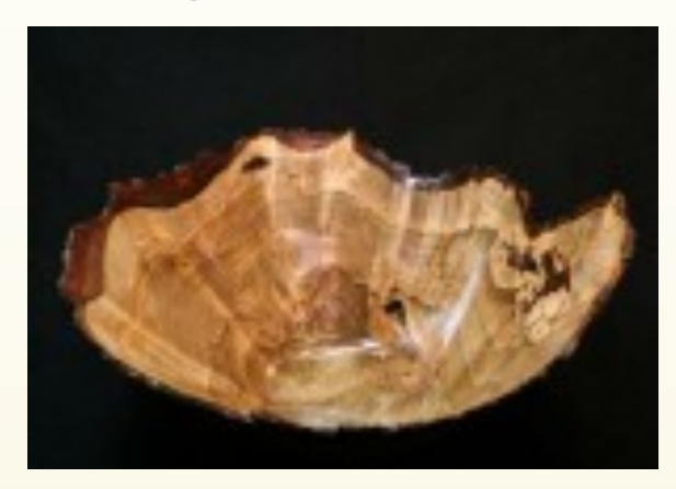
Week of Jan 17 Spalted Maple