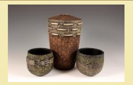
Molly Winton - Gilded Trio