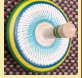
(Continued on page 7)

Tricks you can use to make the top spin faster/longer: make the handle thinner. A top with a 1/8-inch diameter handle will generally spin faster/