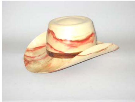
Darrel Rader Box Elder Hat