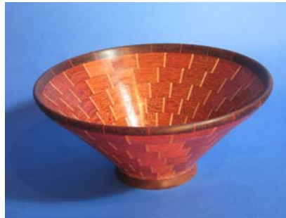
Dick Dlugo Segmented Bub- inga, White Oak and Wenge