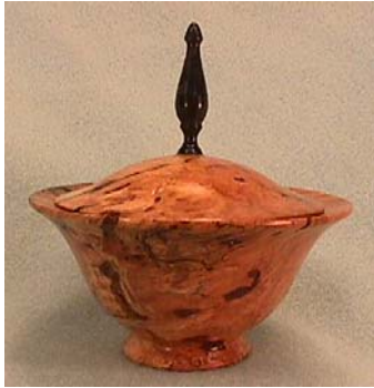
Ed Szakonyi Big Leaf Maple Ebony Final Lidded Box