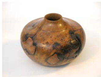
Phil Brooks Heavy Burl Vase