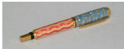
Don McCloskey Birch American Flag Pen