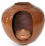
Phil Brooks Box in a Vase