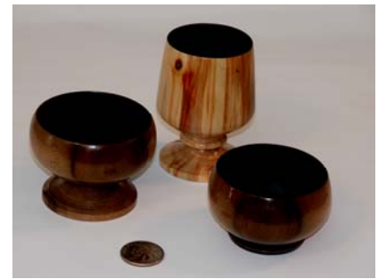
Phil Brooks Miniature Turnings