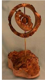
Ed Szakonyi Big Leaf Maple Sculpture