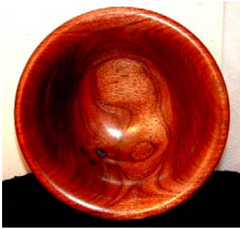
Alice Call Walnut Bowl