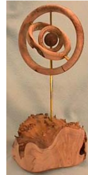
Ed Szakonyii Big Leaf Maple Sculpture