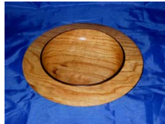
Bill Brown Oak Bowl