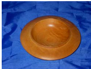
Bill Brown Maple Bowl