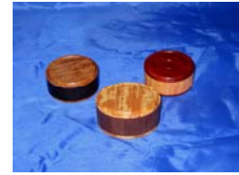
Dan Anderson Walnut -Apple Blackwood-Eucalyptus Locust- Paduk Boxes