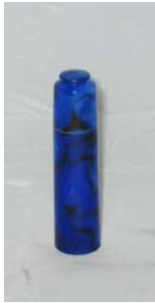
Ken Staggs Acrylic Needle Box