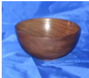
Ken Staggs Walnut Bowl