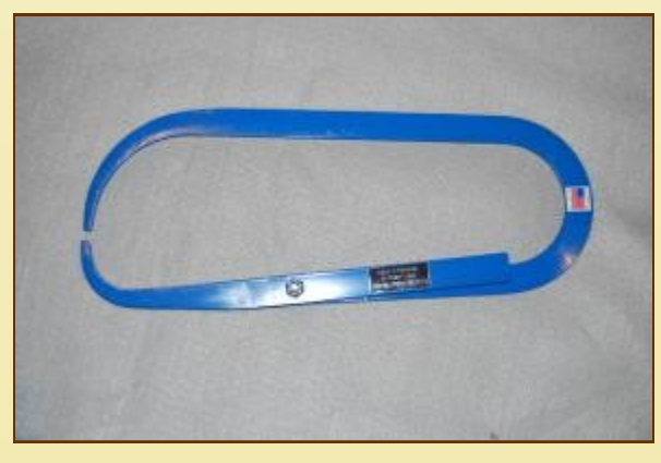
L&R Haverstock Deep Hollowing Calipers.

Maybe you have seen all of these demonstrators before and have mastered all of the skills and techniques that they have to offer. If not, seeing them a second time is sure to add to your understanding. It usually takes a couple of repetitions for things to sink in for most of us anyway. Besides, all of your turning buddies will be there. You may even have a new set of L&R calipers for your efforts. So stop procrastinating and register by May 20<sup>th</sup>. We'll see you this August in Mundelein!