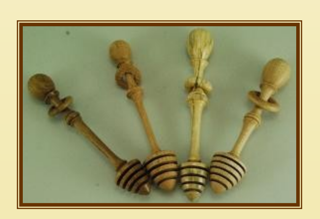
Ken Staggs - Various