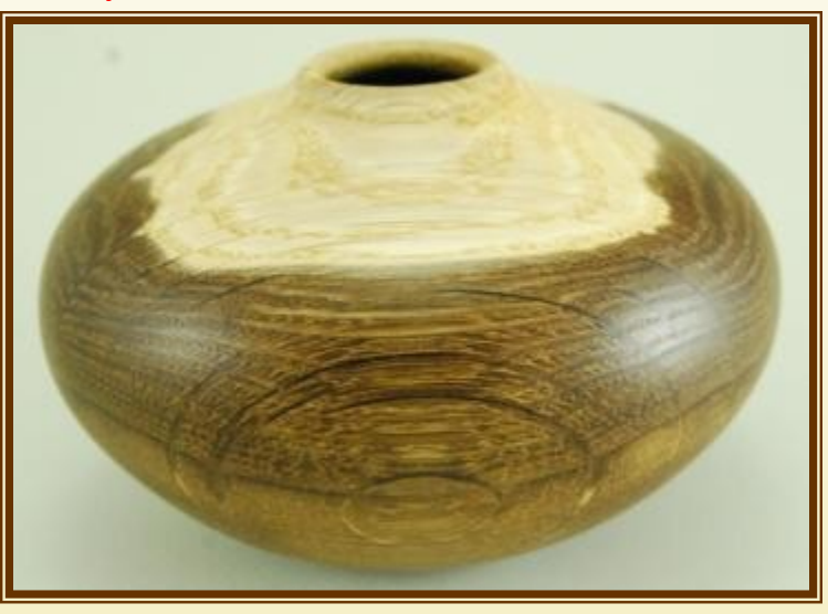
Lars Stole - Oak