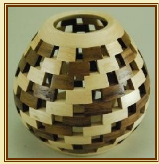
Jerry Kuffel - Walnut