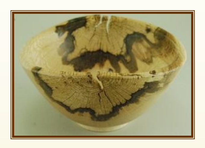
Larry Fabian - Maple