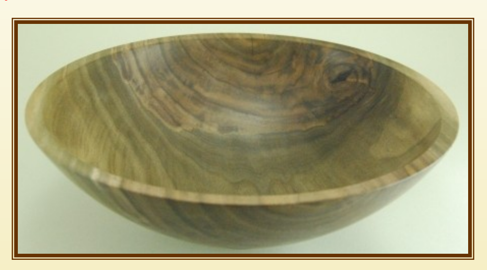
Roberto Ferrer - Walnut