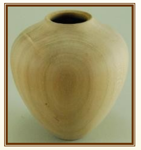
Lars Stole - Cherry