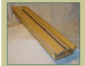
The sanding sled