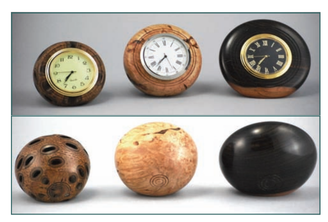
Clint Stevens 3 Clocks