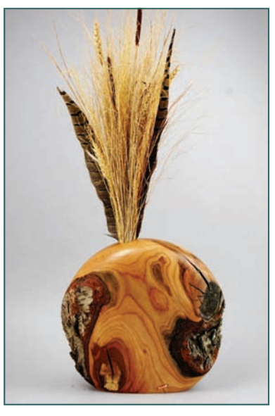
Rich Fitch Cherry, Pheasant Feathers