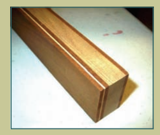
Glued-up laminated stock