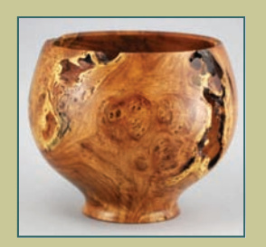
Tom Eovaldi Black Cherry Burl Vessel In progress

It's nice to see Tom back in the shop after time off for some shoulder repair. This vessel, even if Tom says it's not done, needs little, if any, repair. The globe shape is just right to my eye. The base, well, maybe it's not quite done. I like the small flare, but a little smaller would do for me. My personal woodturning critic (she sees the ones you don't see from my shop) thinks that no flare would be better.