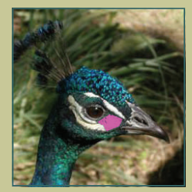
A blushing peacock