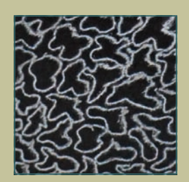
Dave Buchholz See page 10