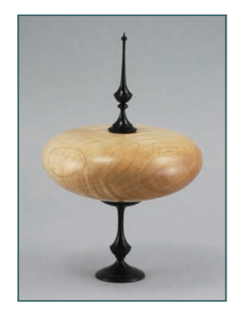
Alan Carter Maple, Blackwood