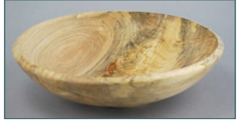
Ken Staggs Silver Maple