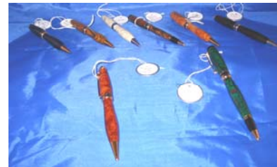
Chuck Young Abohya Burl, Spalted Maple, Birdseye Maple, Eb- ony, Maple Burl, Bocote, Corian, Bleached Abohya Burl Pens