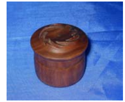
Andy Kuby Walnut Box Inside Spiral