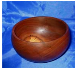
Bill Brown Spalted Walnut Bowl