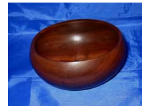
Bill Brown Spalted Walnut Bowl