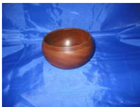
Bill Brown Spalted Walnut Bowl