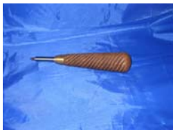
Andy Kuby Walnut Screw- driver