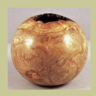
Fran Islin Red Oak Burl

Sometimes, simpler is better. Fran's little round vessel is a study in understatement. No beads, no carving, nothing but pure form. The simplicity lets the wood speak.