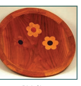
Dick Sing Inlaid Platter (1989)