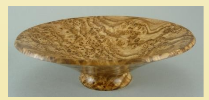
Dick Sing Black Oak Burl