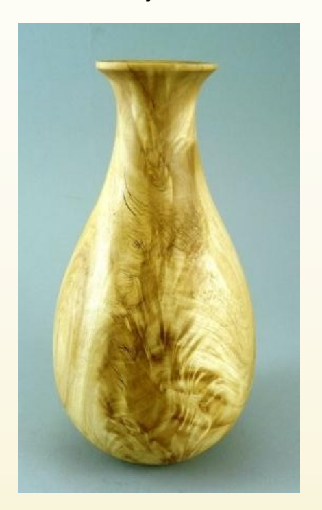
Rich Nye Cottonwood