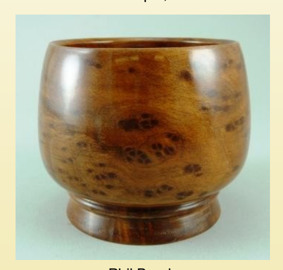
Phil Brooks Redwood Burl