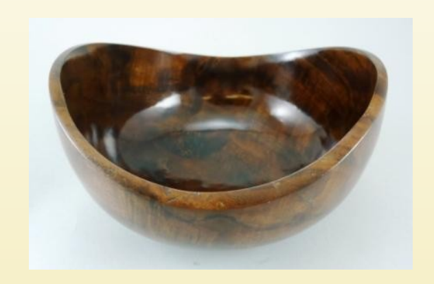
Phil Brooks Figured Walnut