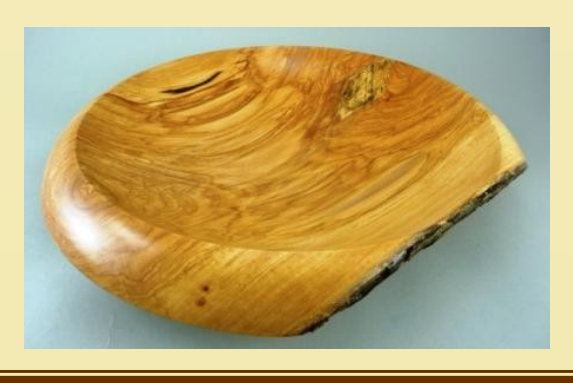
Ken Staggs Maple