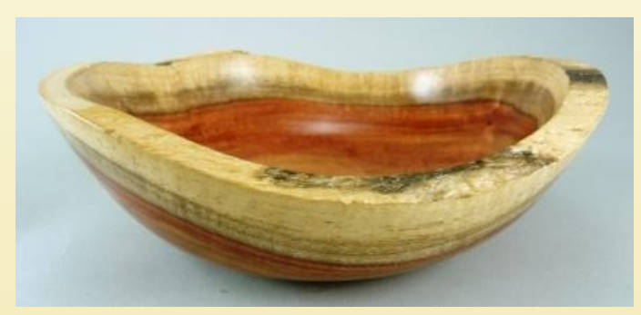
L Hill Carob