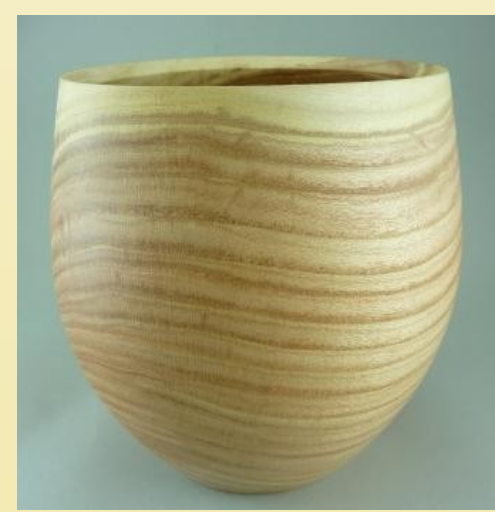
Unknown Honey Locust