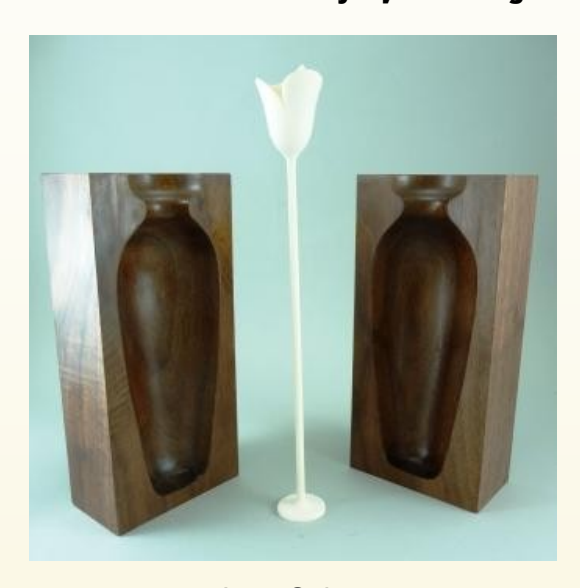
Lars Sole Walnut, Holly