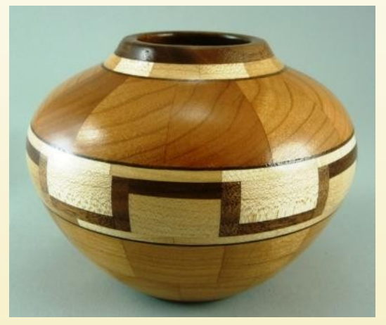
Al Miotke Cherry, Maple, Walnut