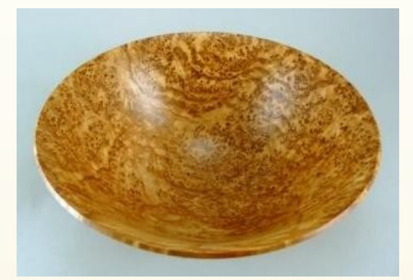
Dick Sing Black Oak Burl