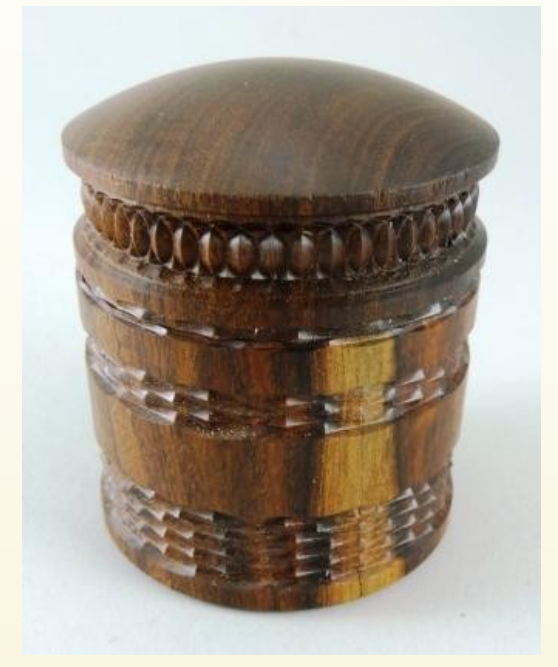
Rich Nye Leadwood