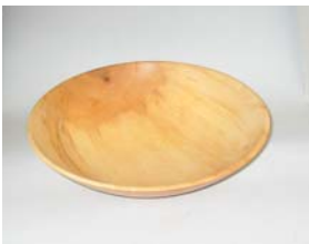
Dick Sing Maple Bowl