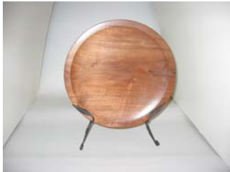
Bill Brown Walnut Platter