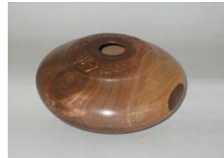
John Eslinger Black Walnut Vessel