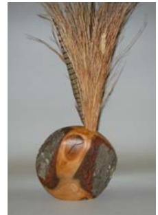
Rich Fitch Prairie Grass Vase