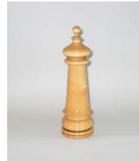
David Bray Maple Pepper Grinder