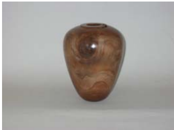
John Eslinger Black Walnut Vase