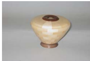
Bob Barbiari Segmented Layered Maple Walnut Vase