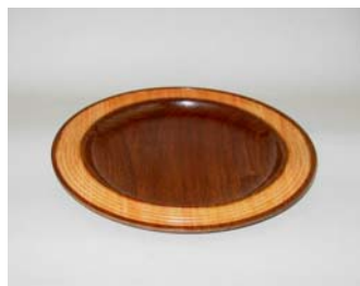
Jerry Howard Bleached Edge Walnut Platter