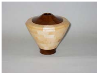
Bob Barbiari Segmented Layered Maple Walnut Vase