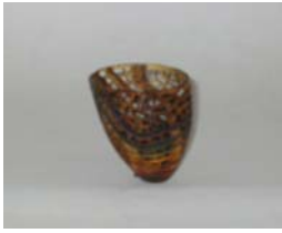
Chuck Young Pierced, Burned Ash Vase