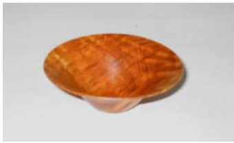
Chuck Young Curly Eucalyptus Bowl