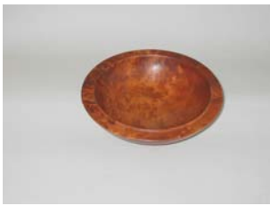
Bill Brown Redwood Bowl