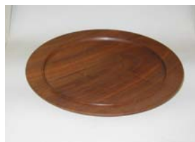
Dick Sing Walnut Platter