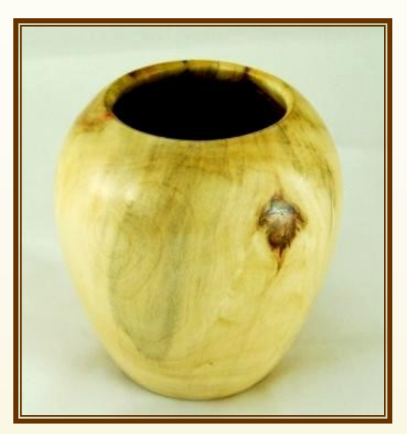
Joe Weiner—Box Elder