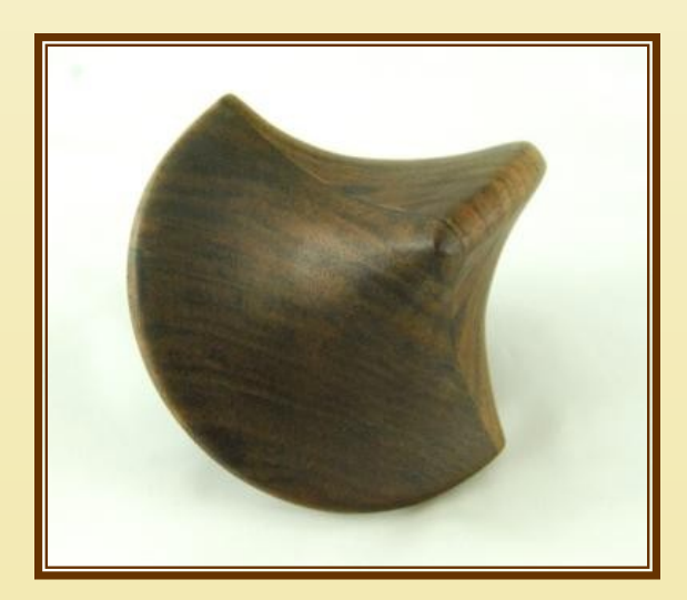
Doug Fuson—Claro Walnut