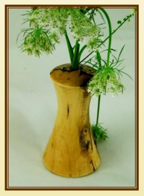
Doug fuson—Spalted Birch