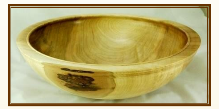
Ken Staggs—Silver Maple