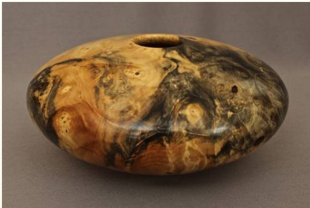
Week of October 1