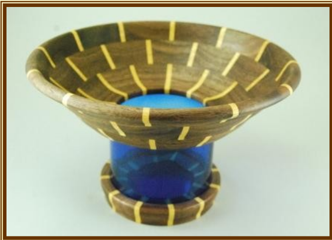
Tom Boerjan—Walnut, Yellow-