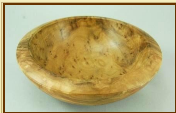
Vince Roetsch - Walnut burl