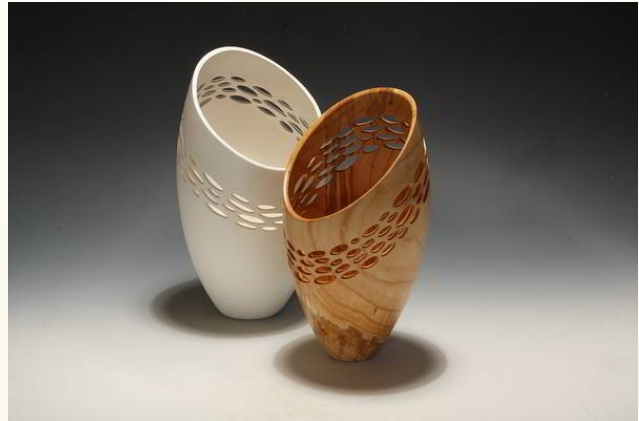
Week of October 21