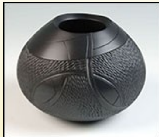
Week of October 28