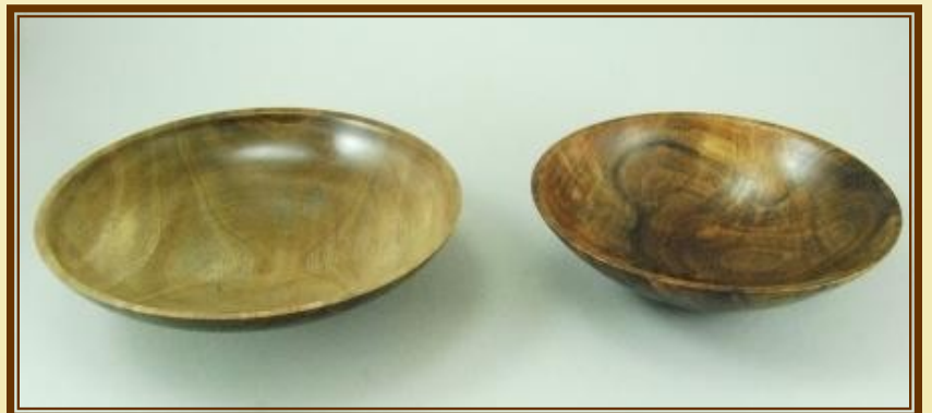
Roberto Ferrer—Maple, Walnut