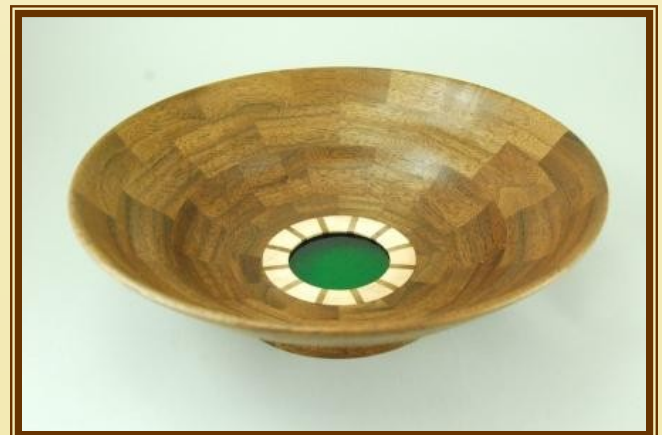
Tom Boerjan—Maple, Walnut